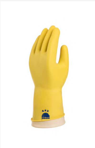
14" INDUSTRIAL GRADE