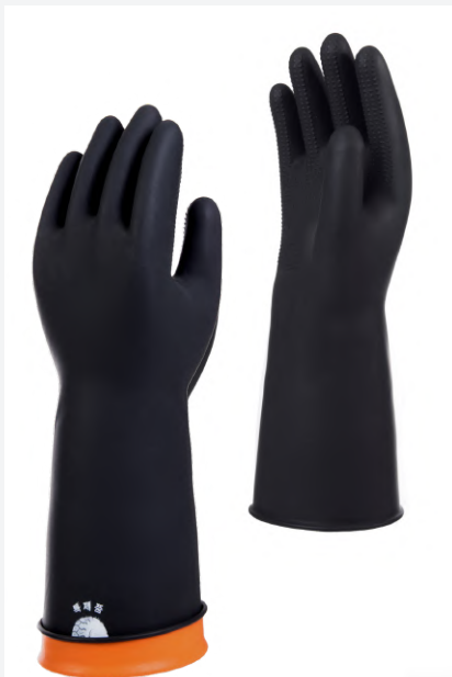
16" HEAVY DUTY INDUSTRIAL GRADE