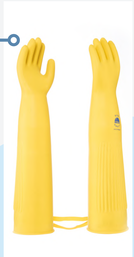
26" FULL-ARM PROTECTION