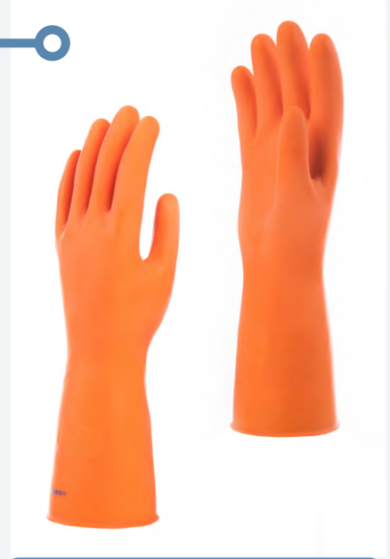
FOOD HANDLING / CLEANING